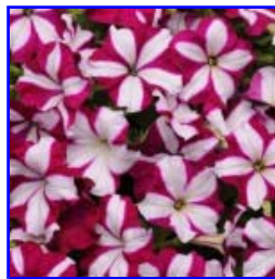
Burgundy Star Petunias from Ball Horticulture (Easy Wave)