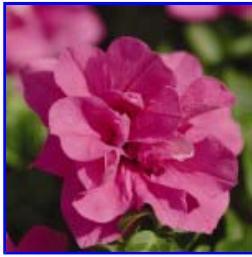
Neon Rose Petunias from Ball Horticulture (Easy Wave)