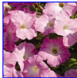
Mystic Pink Petunias from Ball Horticulture (Easy Wave)