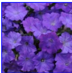
Denim Petunias from Ball Horticulture (Shock Wave)