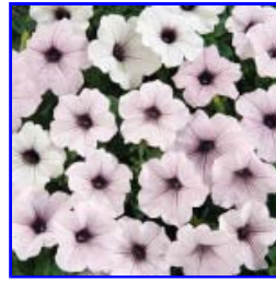
Silver Petunias from Ball Horticulture (Tidal Wave)